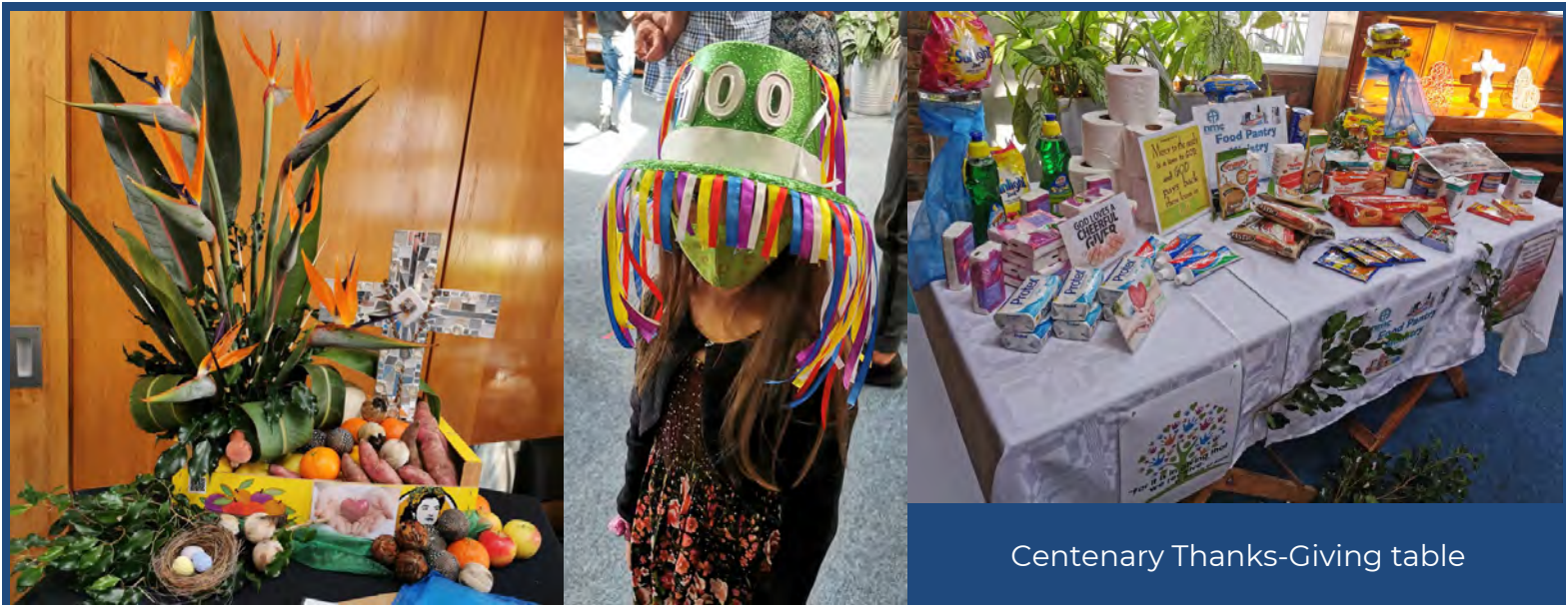
Centenary Thanks-Giving table

The Laity Service gave a few members the opportunity to share how working for God through NMC has made a difference in their lives. The young adults performed the Hands Play which was very moving and thought provoking. Members who would like to become more involved with the adhoc duties in the church are welcome to contact the office to find out where their assistance would be appreciated.